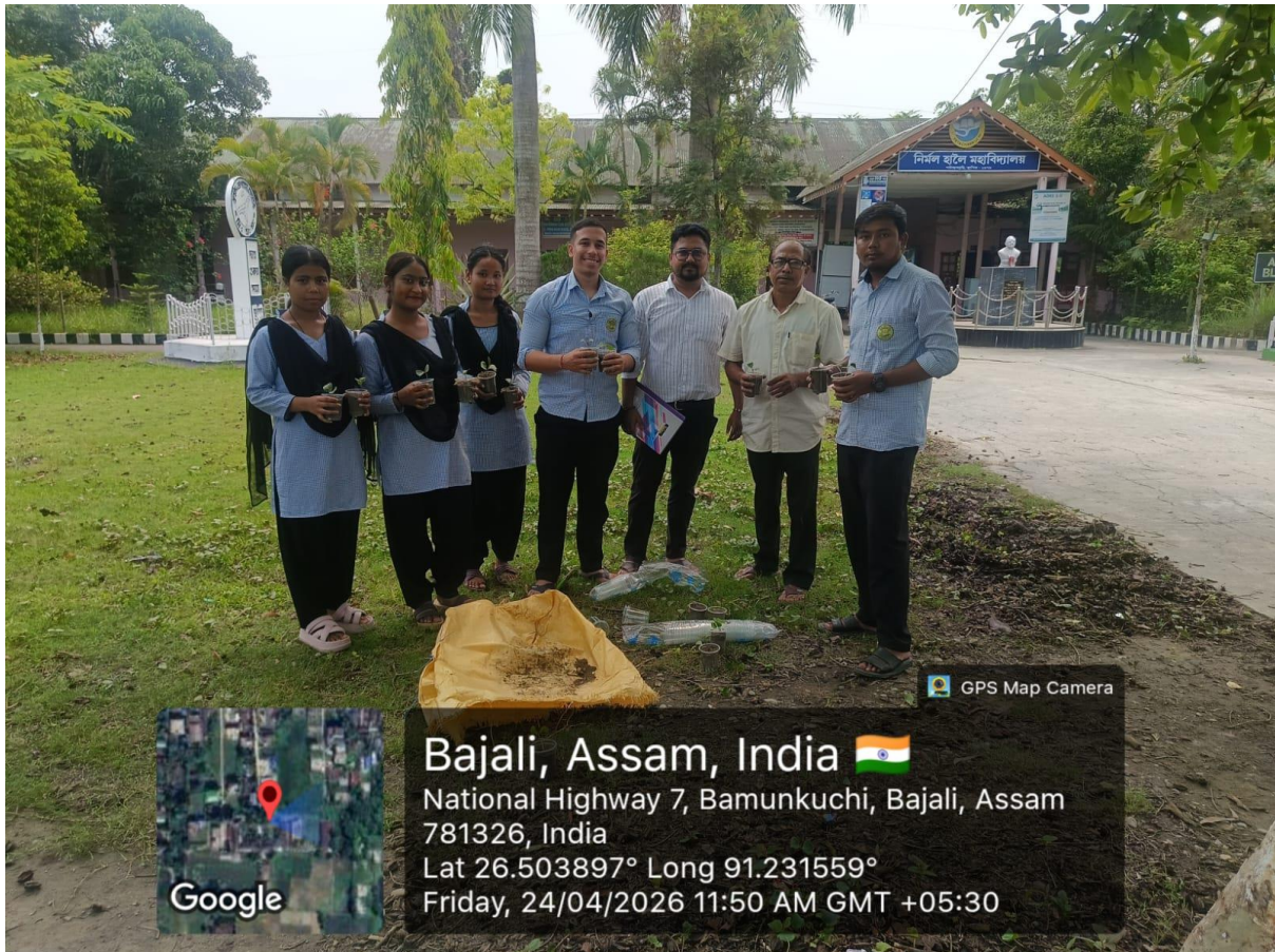
Students participated in a tree plantation drive.