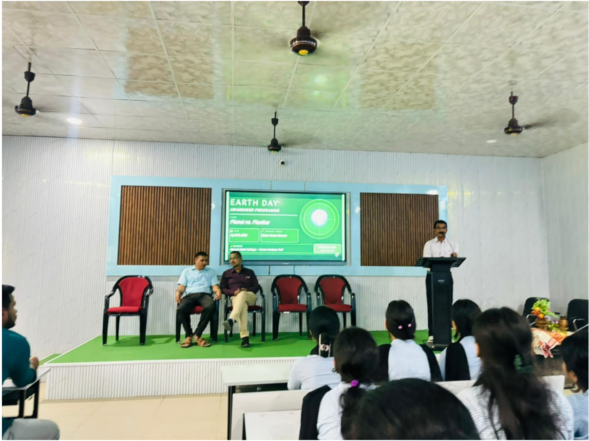
Resource person of the programme.