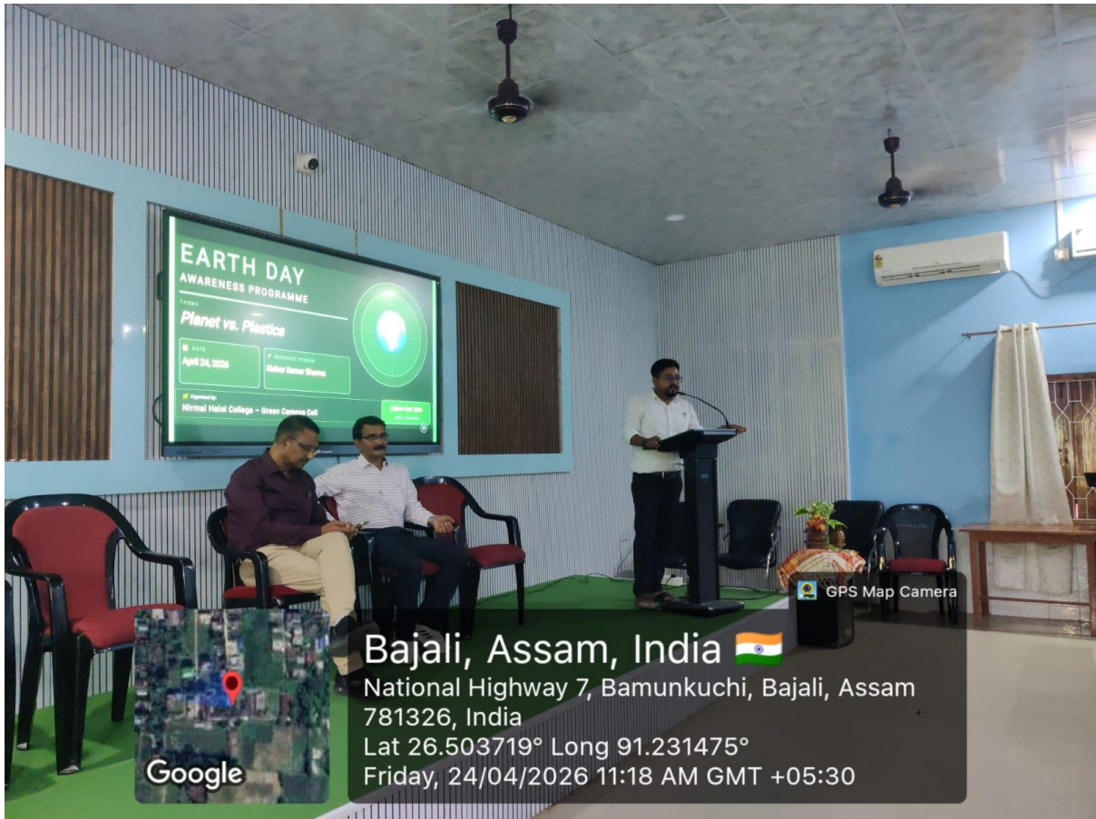
Co-ordinator of the green campus cell.